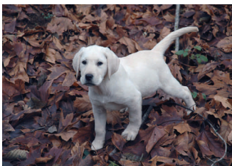
"Hooch" a new kid on the block

In an effort to diversify selection here at Alderwood, we have added "Hooch". He is a yellow Lab but so light in color he could be referred to as white. Just a little touch of gold on the ears and some on his back. As he grows there may be more yellow appear, but we are hoping that he stays real light. Hooch won't be ready to breed for another year but he is taking lessons from Doc. It is amazing how those two get along with each other, Hooch follows Doc everywhere, worries him to death! It is amazing to watch a pup's personality develop. You can see the pictures of Wiley and Gretchen at the top of this newsletter. We kept them to perpetuate Amber's bloodline. She is four years old now and we will only get a few more litters from her before she is retired to the front porch. Amber is one of the most even tempered, best disposition Labs we have ever met. It appears that she has passed these traits along to our pups. We hope that Gretchen and Wiley will pick up where their Mama left off. The combination of Doc's personality with Amber's is going to make some outstanding Labs, not to mention the confirmation features of both... we're excited!